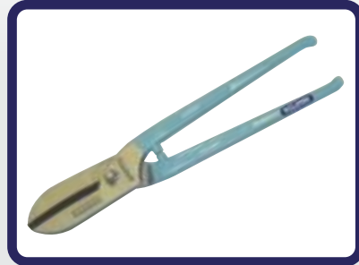
GENERAL PURPOSE SNIPS